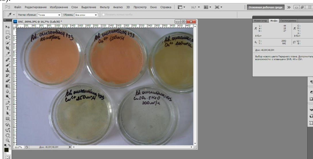
Fig. 1. Defining Lab color model parameters in Adobe Photoshop CS8

After visual assessment of the intensity of pigment accumulation of yeast colonies, Petri dishes with grown cultures were photographed at a distance of 25-30 cm from the camera objective in the "Macrofilming" mode without flash. A Nikon D3100 digital SLR camera was used. After that, the photos were loaded into the Adobe Photoshop CS8 graphic editor. A Gaussian Blur filter with a Radius of 20 pixels was used to remove minor digital noise in the image. After that, the "Lab" mode was set and the parameters of each of the three channels were obtained: L - brightness; a - the value of the red-green component; b - the value of the yellow-blue component (at 10 arbitrary points of the Petri dish; the number of petri dishes in the sample is 5 Petri dishes for each sample of Copper ions concentration) (Fig. 1) (Rylsky et al., 2010). Unlike the classic RGB model, it is the Lab color model that represents colors as they are seen by a person with normal eyesight. After that, the average arithmetic value was calculated for each of the Lab channels, the data was entered into the CIEDE2000 program, and the dE value was obtained (the difference in the intensity of pigment accumulation of the yeast culture between the control and experimental samples).