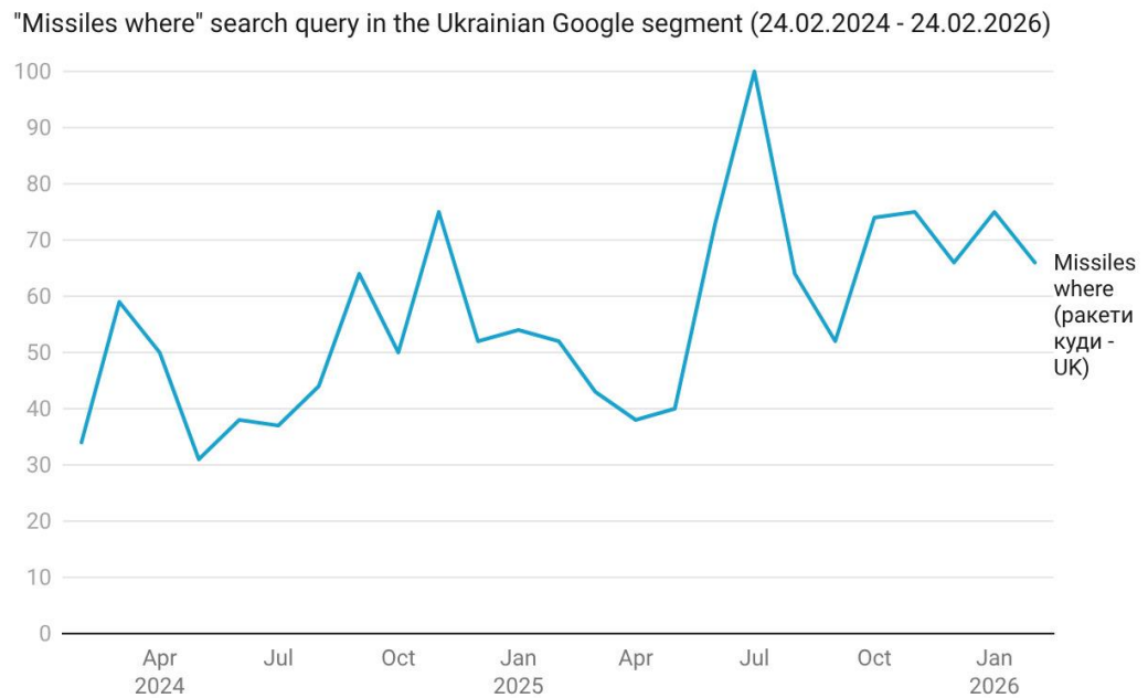
Chart: Khrystyna Kukharuk • Source: Khrystyna Kukharuk • Created with Datawrapper